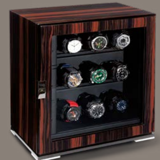
Rotore 9 Zebrano Wood / Black

Crystal door, Zebrano wood outside and leather inside with 6 or 9 programmable winders. Containing watch holders able to hold watch cases of every shape and dimension. With independent lines of winders that can be programmed separately. The entire winding system can easily be removed and stored into a safe.