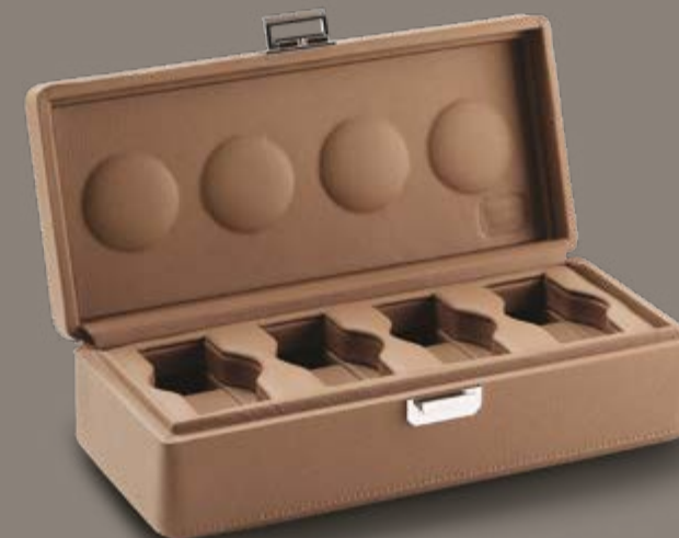
Valigetta 4 Chestnut

H8.5 x W30 x D14 cm - H3.3 x W11.7 x D5.5 Inch H = Height - W = Width - D = Depth