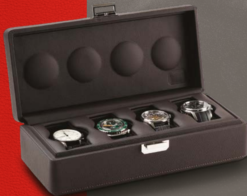
Valigetta 4 Chocolate

Full leather carrying case for 4 watches with leather straps or bracelet suitable for regular size watches and oversize ones (diameter of the case, crown included, 56mm).