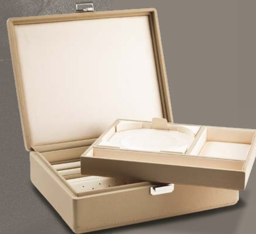
Tesoro Grande Leather and Silk

H9 x W30.5 x D25.5 cm - H3.5 x W11.9 x D9.9 Inch H = Height - W = Width - D = Depth