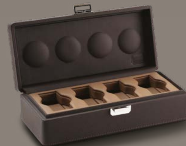
Valigetta 4 Bi-color