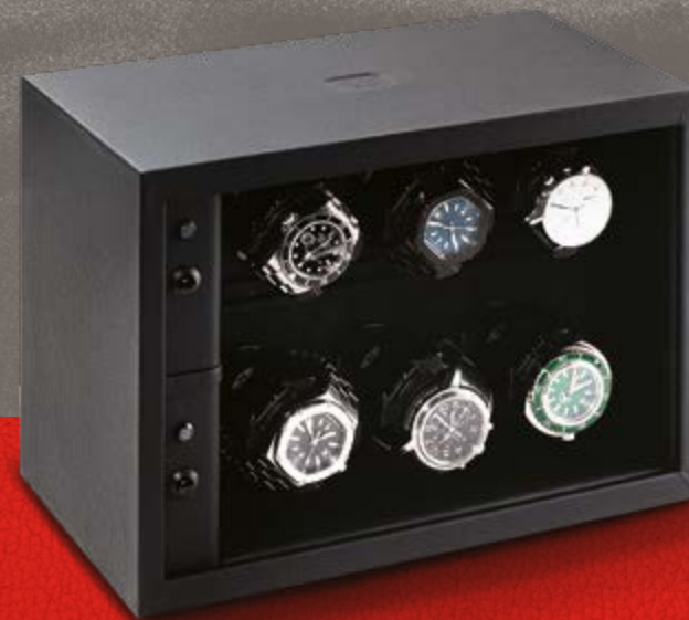
Cornice 6 Black