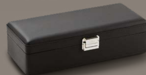
Valigetta 4 Black