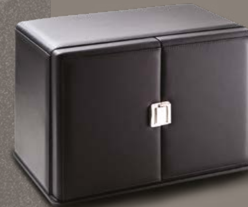
Rotore 6 Black