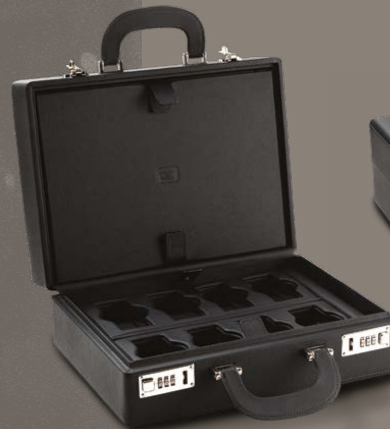
Valigetta 16 Black