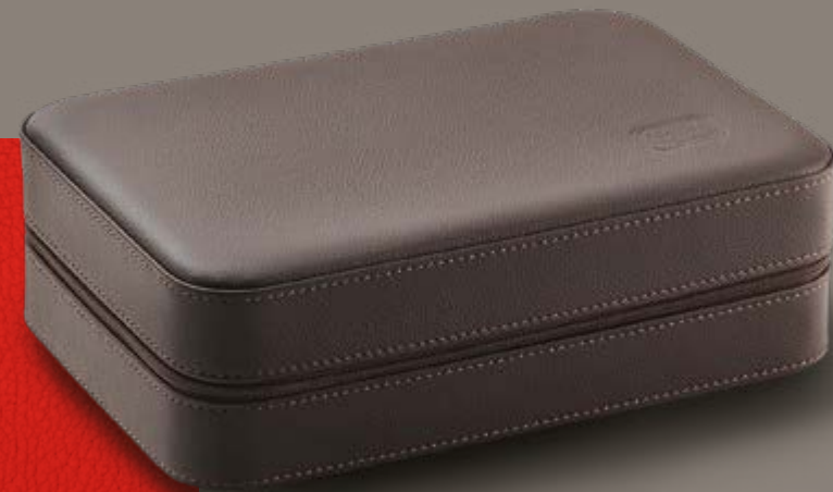
Viaggio 6 Chocolate