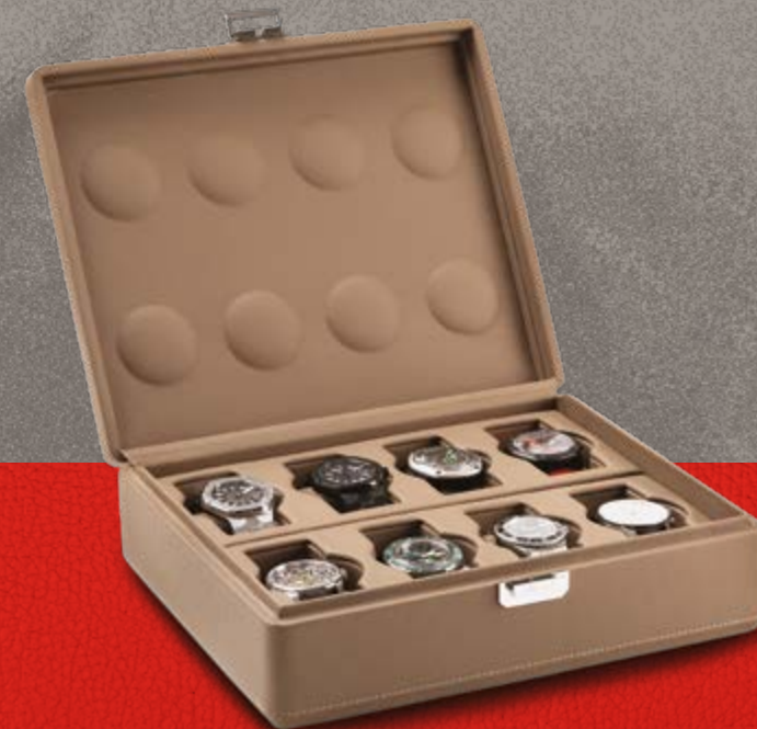
Valigetta 8 Chestnut