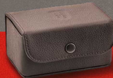
Viaggio 1 Chocolate