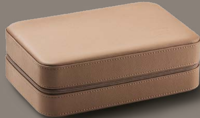
Viaggio 6 Chestnut