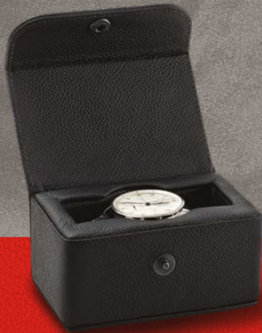
Viaggio 1 Black

Full leather travel case for one watch with leather strap or bracelet suitable for regular size watches and oversize ones (diameter of the case, crown included, 56 mm).