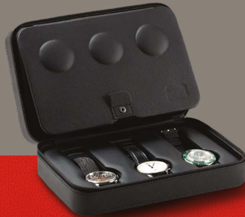
Viaggio 6 Black

Full leather travel zipper case to hold 6 oversize leather strap watches.