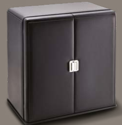
Rotore 9 Black