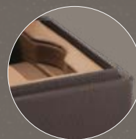
Valigetta 16 Bi-color