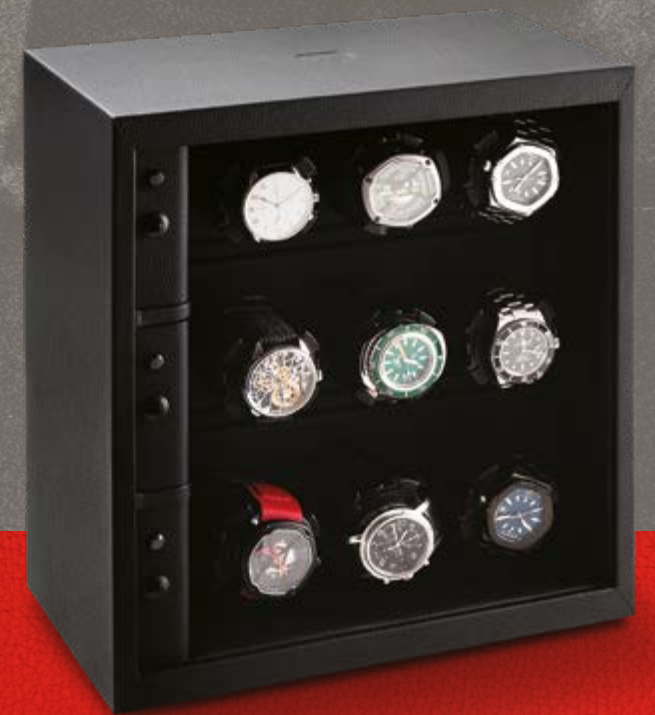
Cornice 9 Black