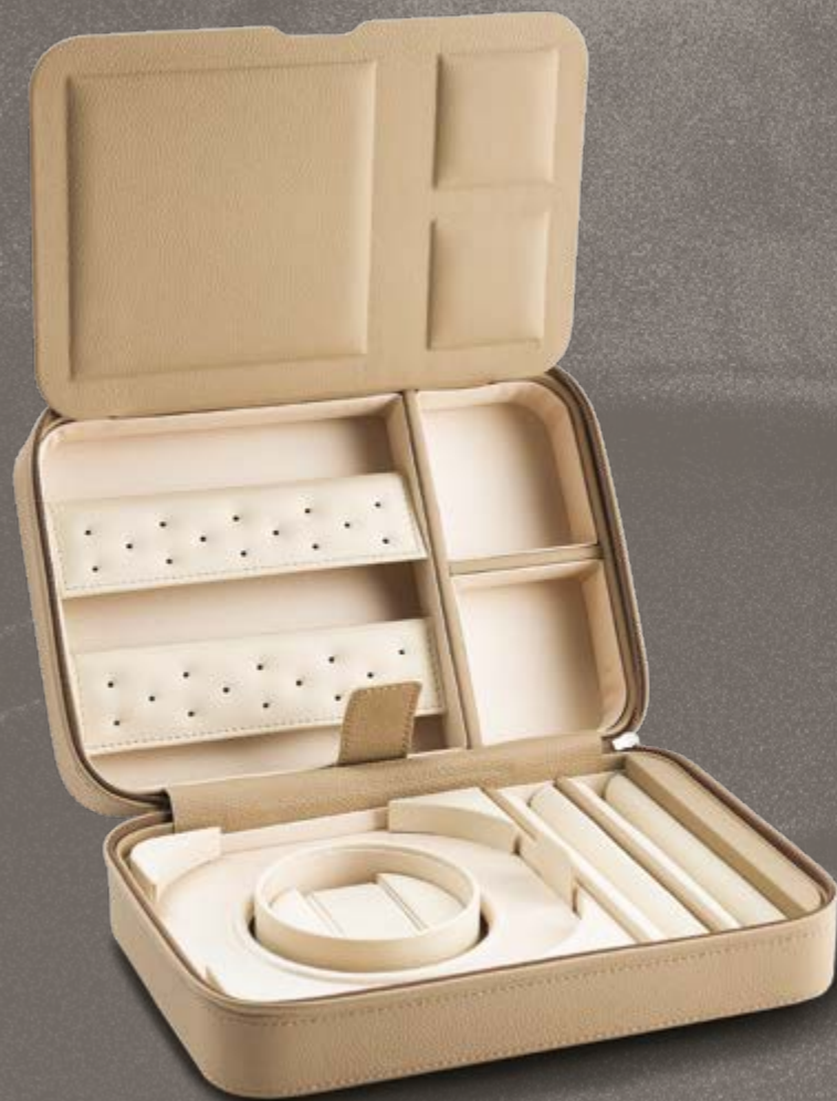
Tesoro Leather and Silk

Full leather zipper travel box for jewelry. 2 models, with or without removable trays.