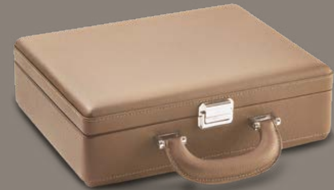
Valigetta 8 Chestnut with handle