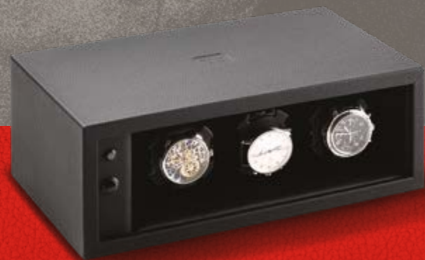
Cornice 3 Black

For the 6 and 9 models, independent lines of winders that can be programmed separately.