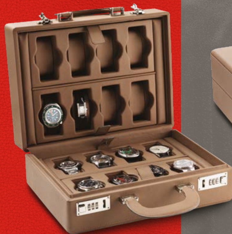
Valigetta 16 Chestnut

Full leather carrying case for 16 watches with leather straps or bracelet suitable for regular size watches and oversized ones (diameter of the case, crown included, 56mm)