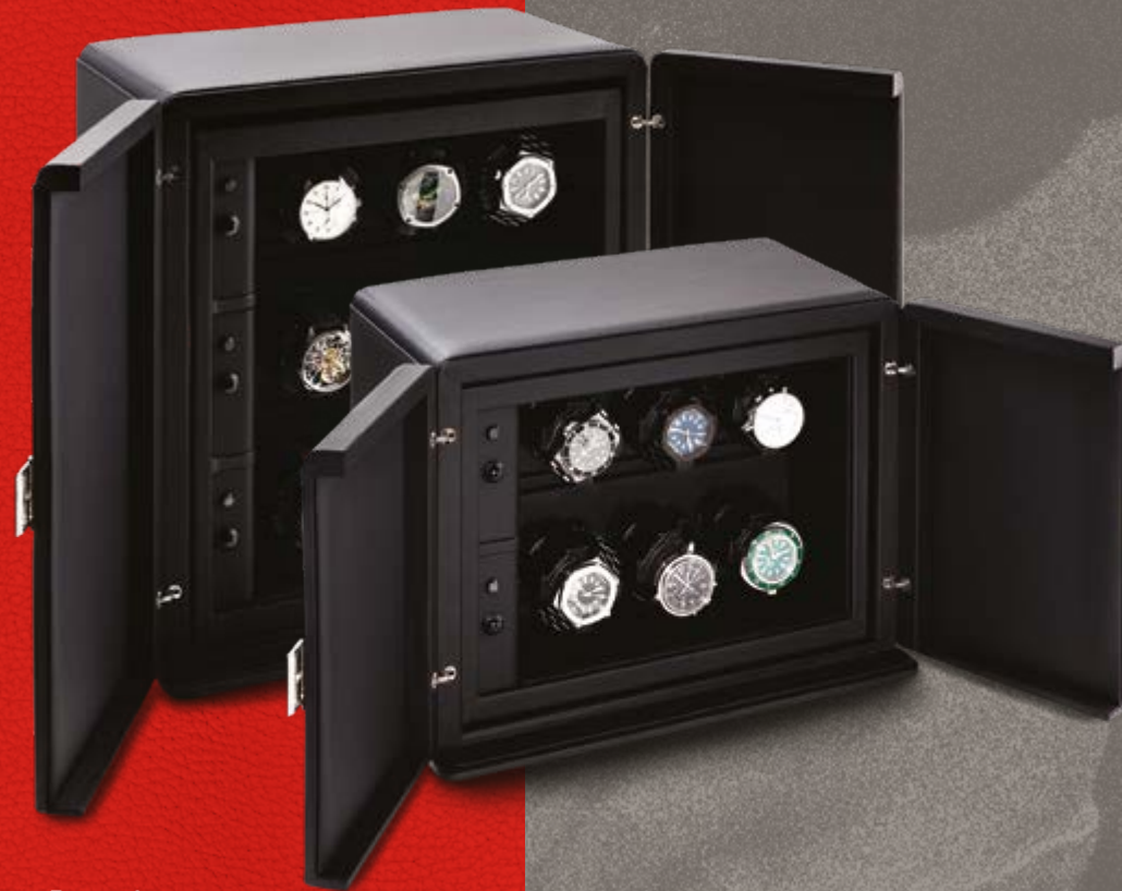
Rotore 9 Black

Full leather case with 6 or 9 programmable winders. Containing a watch holder able to hold watch cases of every shape and dimension. With independent lines of winders that can be programmed separately. The entire winding system can easily be removed and stored into a safe.