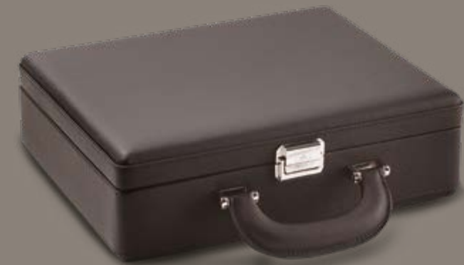
Valigetta 8 Chocolate with handle