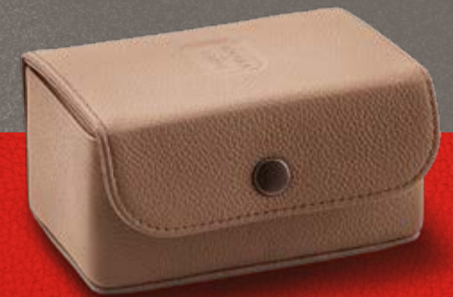
Viaggio 1 Chestnut