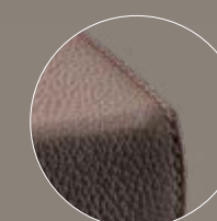
Valigetta 16 Chocolate

H14.5 x W34.5 x D24 cm - H5.7 x W13.5 x D9.4 Inch H = Height - W = Width - D = Depth