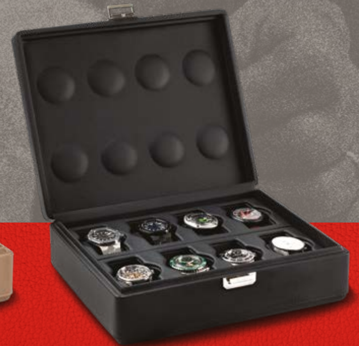
Valigetta 8 Black