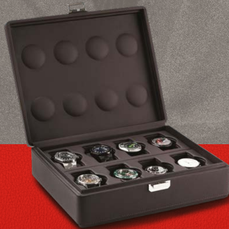
Valigetta 8 Chocolate

Full leather carrying case for 8 watches with leather straps or bracelet suitable for regular size watches and oversize ones (diameter of the case, crown included, 56mm)