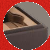
Valigetta 8 Bi-color