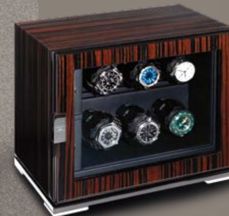
Rotore 6 Zebrano Wood / Black