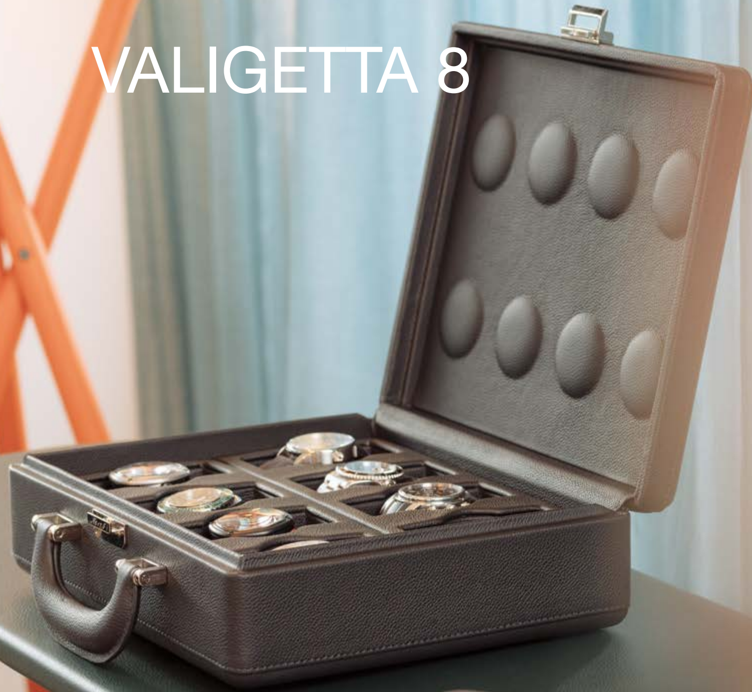
Valigetta 8 Black with handle