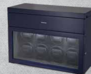
BLACK SERIES 8