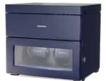
BLACK SERIES 2.16.BL