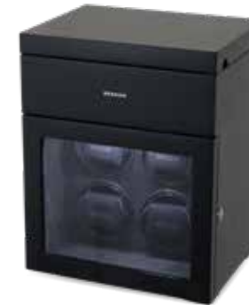
BLACK SERIES 4.16.B