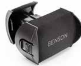
WATCH HOLDER FOR ANY WRIST SIZE