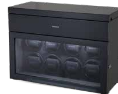
BLACK SERIES 8.16.CF