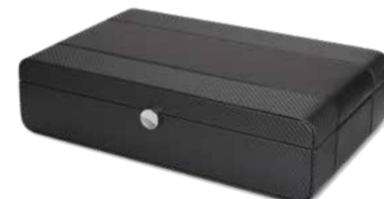
BLACK SERIES WB 16.17.MA