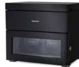
BLACK SERIES 2.16.B