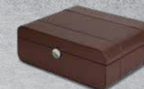
WATCH CASES 8