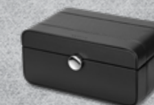
WATCH CASES 3