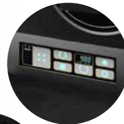
EASILY ADAPTABLE TOUCHSCREEN CONTROL PANEL