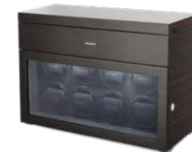
BLACK SERIES 8.16.MA