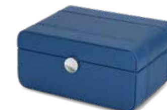
BLACK SERIES WB 8.17.CF