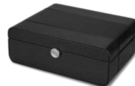
BLACK SERIES WB 12.17.MA