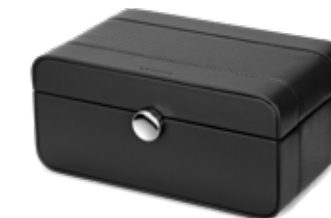
BLACK SERIES WB 8.17.B