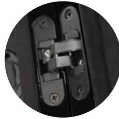
GERMAN MADE HINGES

A SPECIAL COLLECTION OF EXCLUSIVE LARGER CAPACITY WATCH WINDERS WITH A VERTICAL DESIGN AND INNOVATIVE TECHNOLOGY. ITS LAVISH FINISH IN BLACK AND CARBON FIBRE ACCENTUATES THE EXCLUSIVE CHARACTER OF THESE MASTERPIECES.