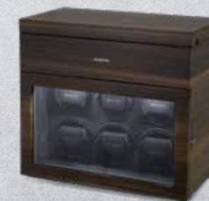
BLACK SERIES 6