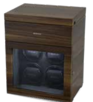
BLACK SERIES 4.16.WA