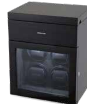
BLACK SERIES 4.16.MA