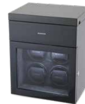
BLACK SERIES 4.16.CF