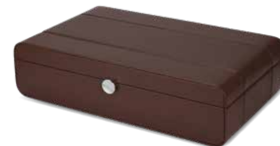
BLACK SERIES WB 16.17.W