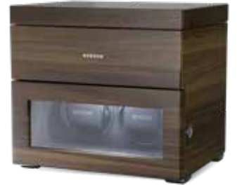
BLACK SERIES 2.16.WA