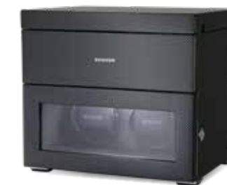
BLACK SERIES 2.16.CF