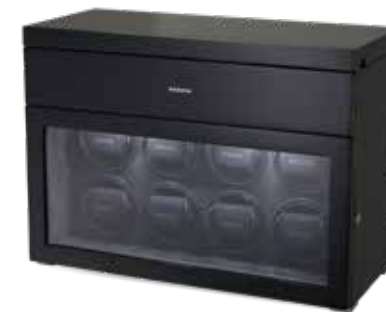
BLACK SERIES 8.16.B