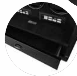
STORAGE FOR EXTRA WATCHES