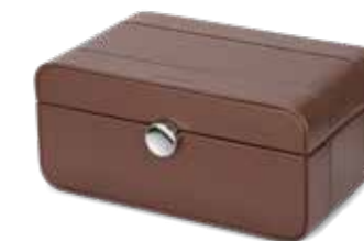
BLACK SERIES WB 8.17.W