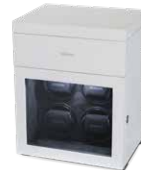
BLACK SERIES 4.16.W