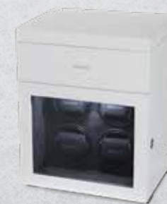
BLACK SERIES 4