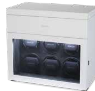
BLACK SERIES 6.16.W