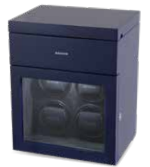
BLACK SERIES 4.16.BL