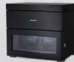
BLACK SERIES 2