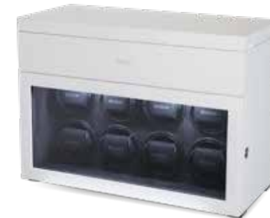
BLACK SERIES 8.16.W