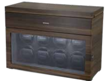
BLACK SERIES 8.16.WA