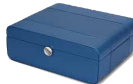
BLACK SERIES WB 12.17.CF