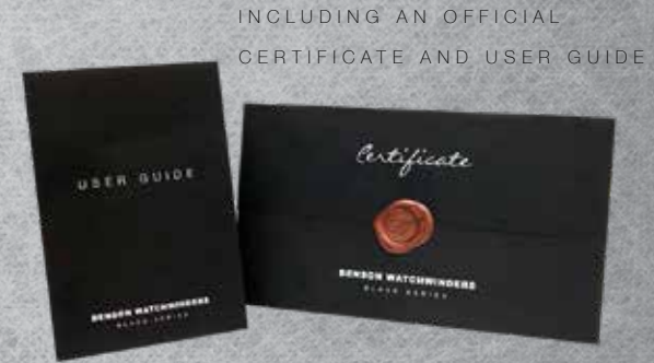
INCLUDING AN OFFICIAL CERTIFICATE AND USER GUIDE