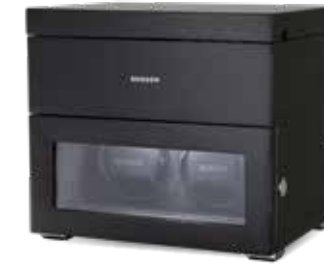
BLACK SERIES 2.16.MA