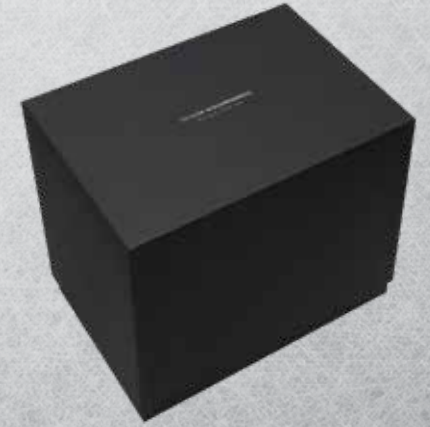
DELIVERED IN LUXURIOUS SPECIAL BOX