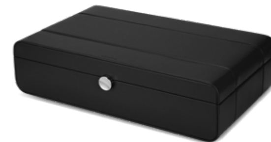
BLACK SERIES WB 16.17.B