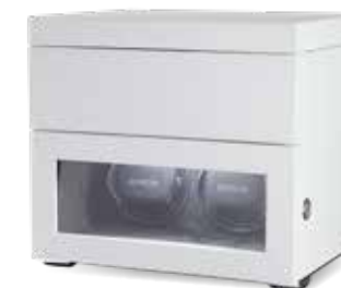
BLACK SERIES 2.16.W