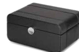
BLACK SERIES WB 8.17.MA