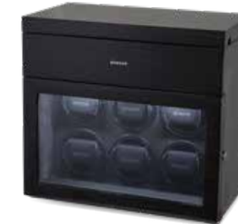
BLACK SERIES 6.16.MA