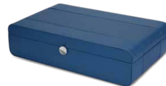
BLACK SERIES WB 16.17.CF