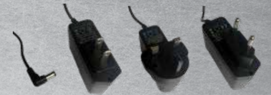
INCLUDING ADAPTER FOR US, UK OR EU