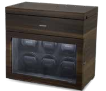
BLACK SERIES 6.16.WA