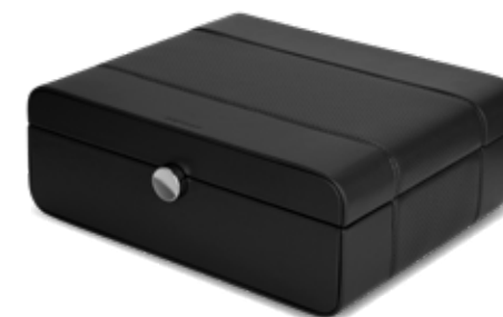
BLACK SERIES WB 12.17.B