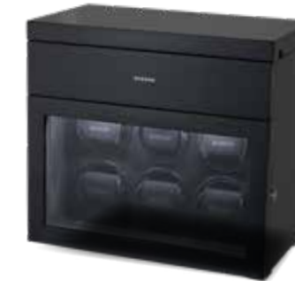
BLACK SERIES 6.16.CF