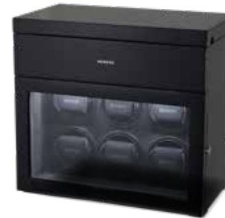
BLACK SERIES 6.16.B