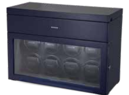
BLACK SERIES 8.16.BL