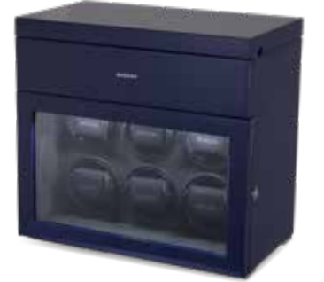
BLACK SERIES 6.16.BL