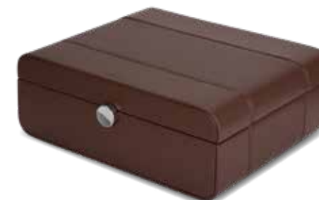
BLACK SERIES WB 12.17.W